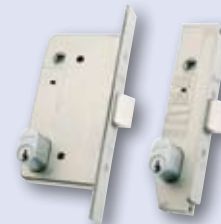
3000 & 2000 Series Note position of hub to cylinder