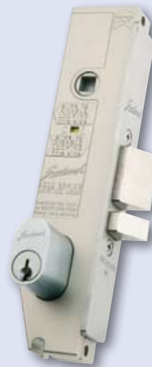
2000 Series with cylinder Cat no. 24C0