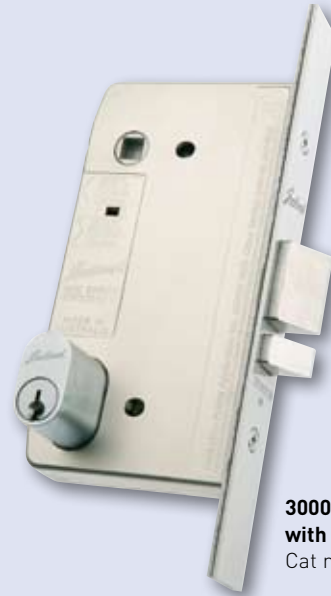
3000 Series with cylinder Cat no. 34C0